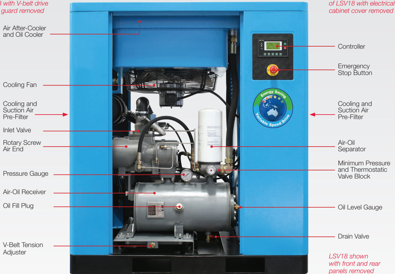
Right side internal view of LSV18 with electrical cabinet cover removed